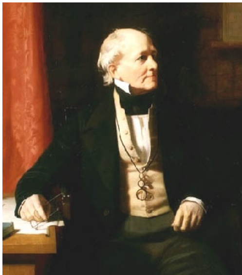
Figure a: A photograph of a 19th century portrait painting of Sir Francis Beaufort (1774-1857). It was copied from the website of the UK National Maritime Museum ( www.nmm.ac.uk ). The photograph is in the public domain under USA law following the Bridgeman Art Library v. Corel Corp. case