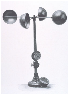
Figure c: The Robinson anemometer. In: The Aims and Methods of Meteorological Work by Cleveland Abbe. In: Maryland Weather Service, Johns Hopkins Press, Baltimore, 1899. Volume I, p. 316.