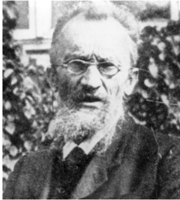
Figure d: Wladimir Peter Köppen (1846-1940)

Around the same time, in 1898 the Russian/German professor Wladimir Köppen (see Figure d) constructed an equivalent scale derived from four independent sets (Groups) of observations made on board ships and at British, Norwegian and German coastal stations (Köppen, 1898).